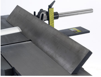
Cast Iron Fence